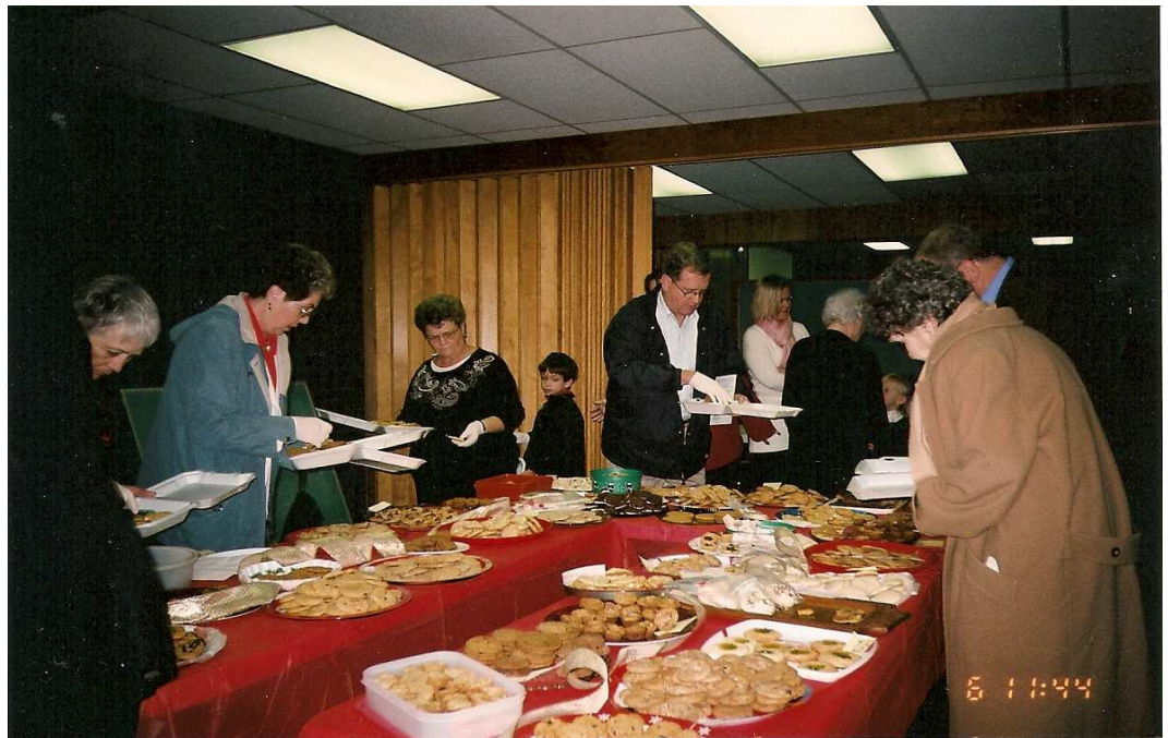
In early December, the WCSS at St. John's Lutheran in Moore, hosted a homemade cookies and candy sale with proceeds going to the church's general funds. They raised $450 on this project.